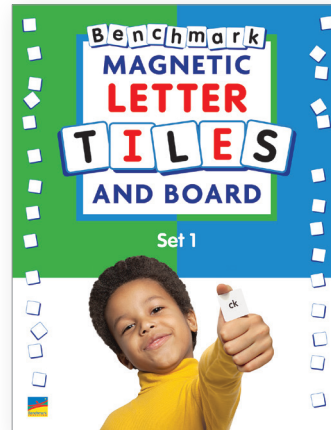
Set 1, English