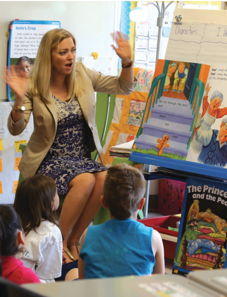
For guided reading, select text that supports your instructional goals yet engages your students.