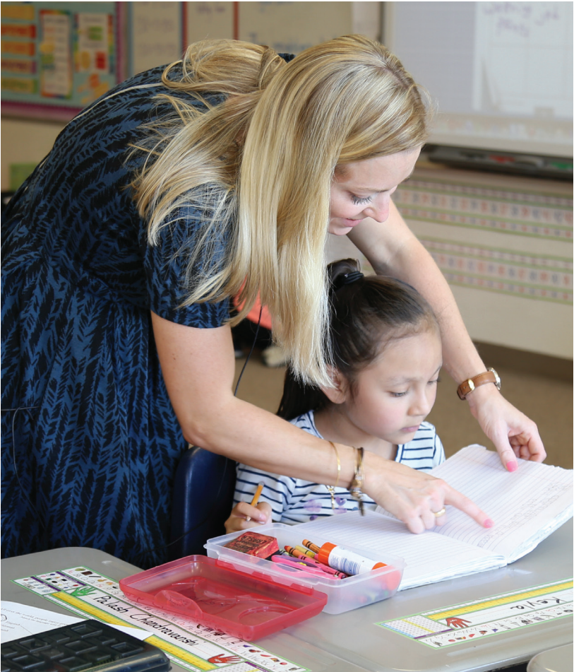
During Reading: The teacher listens in, notes reading behaviors, and prompts individual students as needed. Many teachers move next to a student and listen in over the student’s shoulder.

Be sure to wrap up the lesson successfully. Revisit the purpose of the lesson and check students’ comprehension by encouraging a discussion about the text and how students used the strategy or skill. This should be a collaborative conversation in which students listen to one another and ask questions. Listen to and document students’ responses, making notes about who might need clarification or review of a teaching point. Also, acknowledge students’ hard work in applying the strategy.