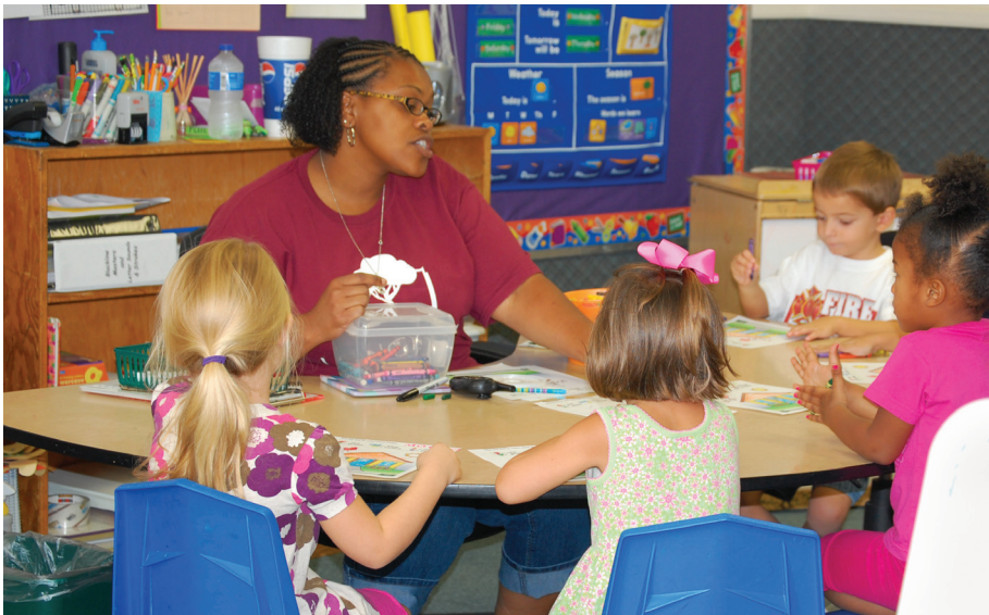
Teachers assign homogeneous (similar-skill) small groups to address children at their point of need.

How the teaching table and worktable are used varies depending upon the number of adults in the classroom and the amount of instructional time available each day.