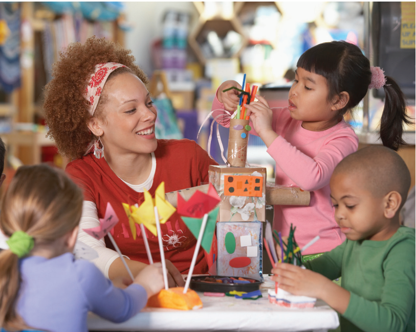
If available, a second adult, specialist, or paraprofessional will provide additional instruction or oversee guided practice activities at the worktable.

In half-day programs, the worktable may be used differently. An adult assistant may teach mathematics or science at the worktable while the teacher provides ELA instruction at the teaching table.