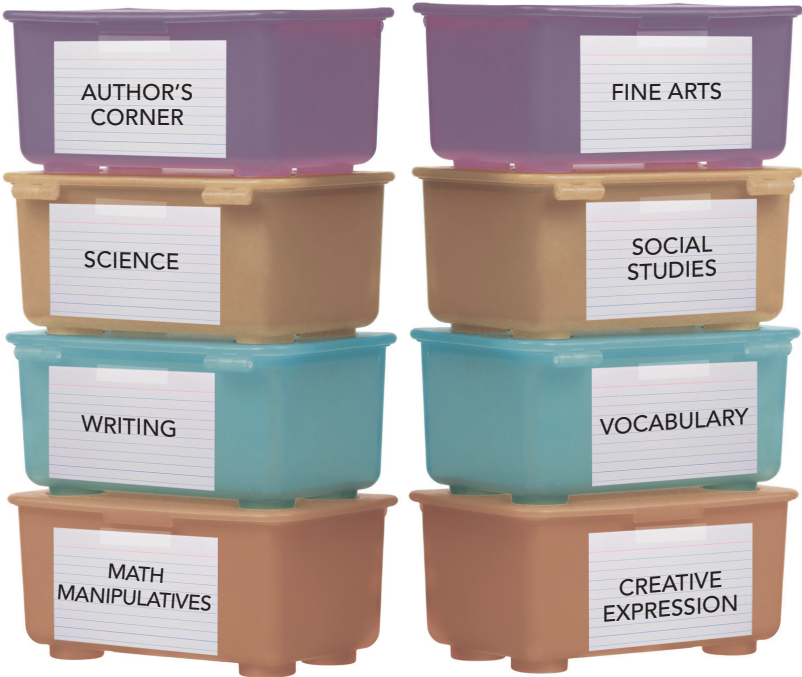
Although there is no set schedule, changing learning centers approximately every two weeks maintains children's interest and enables teachers to align center activities with curricular themes.

Changing learning centers may occur every two weeks, but there is no set schedule. Center themes and purposes can be coordinated with the current curriculum content and skills taught in classrooms. Learning center materials and activities should include familiar content and require skills that have been previously taught in small groups with adults so that children participate successfully without immediate adult guidance.