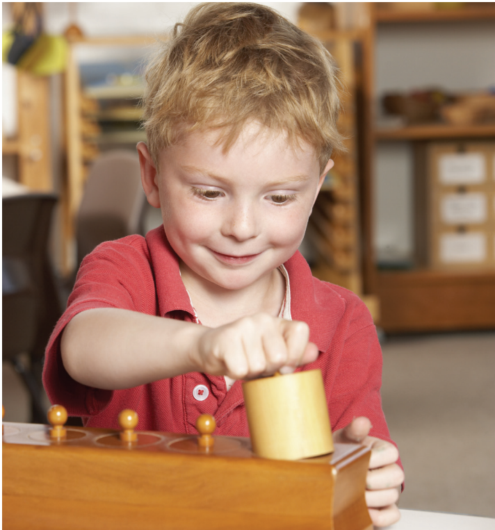
Learning centers vary in content, balancing academic activities with creative play to promote physical, social, and emotional development.

Some learning centers will not change substantially throughout the year. For example, media centers or reading centers may require that you change the content or materials, but their basic setup will remain the same. Some centers that may remain in your classroom all year include a home center, block center, art or creative center, and science discovery and mathematics centers.