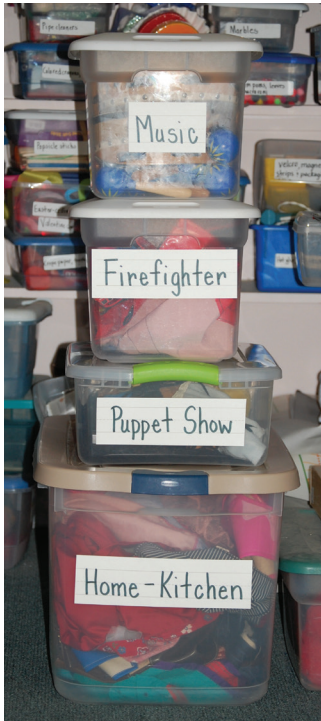
Storing materials safely and out of reach prevents problems. Labeling containers and contents facilitates use of resources when shared by teacher teams.