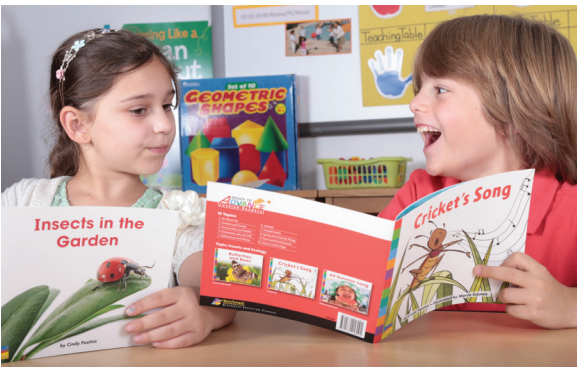
Reading partnerships and writing partnerships are an important aspect of the Workshop model.

Partnerships and partner work are a vital part of workshop. Workshop teachers know that the writers and readers in their classroom community rely on partnerships. Partnerships are an essential structure in the architecture of a workshop. Aside from providing moments for all learners to orally express or rehearse thinking, partnerships that have strong “conversational capacity” take ownership of their learning and contribute to the learning of others. Working within a partnership does not always come naturally, so part of workshop teaching is coaching partners to seek out, give, and receive feedback. When peers provide feedback, share thinking, and head toward a learning goal together, it helps them process their understandings. It is essential to provide time for partners to plan, read, write, and talk throughout the day. Partnerships can be assigned or based on student choice. For example, a teacher might pair two readers as they leave a guided reading group to do some rereading of the text together. Two writers might team up spontaneously because both are ready for revision feedback at the same time.