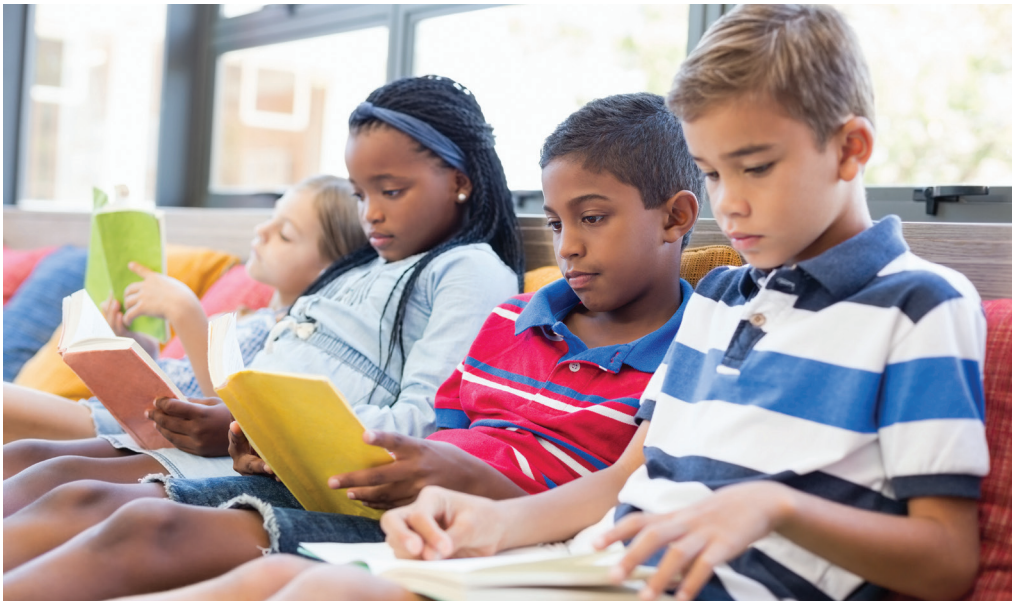
Independent reading time is time when students can develop their identities as readers.

Independent reading is a central part of workshop that occurs each day and often follows a teacher’s mini-lesson. During independent reading, students may read a text of their choice or may reflect on their reading in a reader’s notebook. Several factors contribute to why a reader chooses a book and whether or not the student reads deeply, including personal interest, background knowledge, and positive experiences. When readers pursue a topic they’re curious about or know something about, they seek out books on topics of interest. When they like a character in a series or enjoy the author’s style of writing, they look for that type of book. Sometimes they need guidance to read beyond their known areas of interest. Having access to a book collection in a classroom library as well as a school library is essential for wide reading by all students, including English Learners. The readability of the text is a factor in selecting and staying with a text. Readability (i.e., reading level, vocabulary, type size and spacing, page layout, illustrations, headings, etc.) affects overall text appeal, but so does the reader’s purpose for reading.