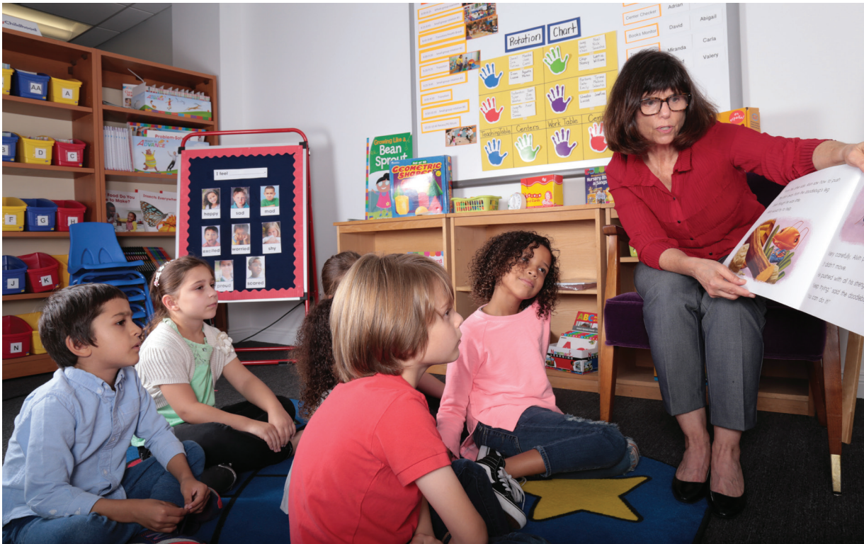
The teacher models for readers the wondering, inferring, and picture reading that supports comprehension.

Interactive read alouds are similar to read alouds, yet here the students take a larger role by conversing with the teacher and partners at key points in the read aloud. In planning the interactive read aloud, the teacher identifies the most natural places in the text for modeling reading strategies such as making inferences, determining meaning of unfamiliar vocabulary, and using pictures to support meaning. The teacher reads aloud, inserting comments and questions that invite students to think about characters and the challenges the characters face. The teacher invites students to infer, explain, and ask questions that help them make meaning. All of these types of read alouds belong in every school day, as they provide readers with sheer enjoyment of story and information, as well as providing modeling of comprehension strategies needed for independent reading.