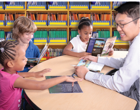
Membership in any type of small group is short term, and flexible, because readers’ interests and needs are ever-evolving.

Deep Reading Groups , which are outside Workshop, provide students with an opportunity to reread text, most often at a challenge level, and to dig deeper into shorter sections for a specific purpose. Annotating the text, often while working with a partner, encourages students to remember that deeply understanding an author’s ideas and text structures requires actively noticing and questioning every line. These reading groups, sometimes called close reading groups, are aligned to concepts taught at the whole group level. In the small group, students can stretch to high-level text because they may be rereading a section from the whole group instruction—which means they may have heard and even seen the text before they meet in the small group. Teachers may also choose a text that aligns and amplifies instruction occurring in the whole group. By reading, rereading, annotating, and connecting the learning to core instruction, students can have the scaffolds needed to engage with higher-level texts in the small group. Small group instruction doesn’t mean only instructional or lower-level texts are used; connecting the learning can stretch the challenge level of the reading.