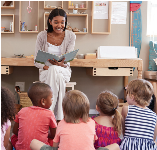
In a Reader’s Workshop, teachers read aloud each day so that students are immersed in the rich language and content of fiction, nonfiction, and poetry.

“ Education is not preparation for life but life itself. —John Dewey ”