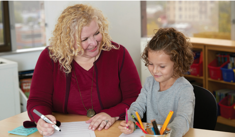
Students apply a strategy modeled in the mini-lesson when it makes sense for their work.

Mini-lessons are ideally only 5–10 minutes in length, depending upon the time of year, grade level, content complexity, and the needs students demonstrate in their daily work. A teacher might choose to offer a mini-lesson using a shared reading, interactive read aloud, demonstration, or discussion. Mini-lessons build on each other in a learning progression across a week and across a unit. They are the heart of the modeling and mentoring in a workshop-based literacy curriculum.